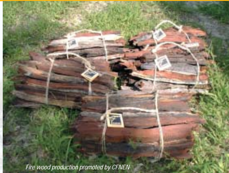
Fire wood production promoted by CFNEN

Any interested person is invited to contact CFNEN project at the following address: